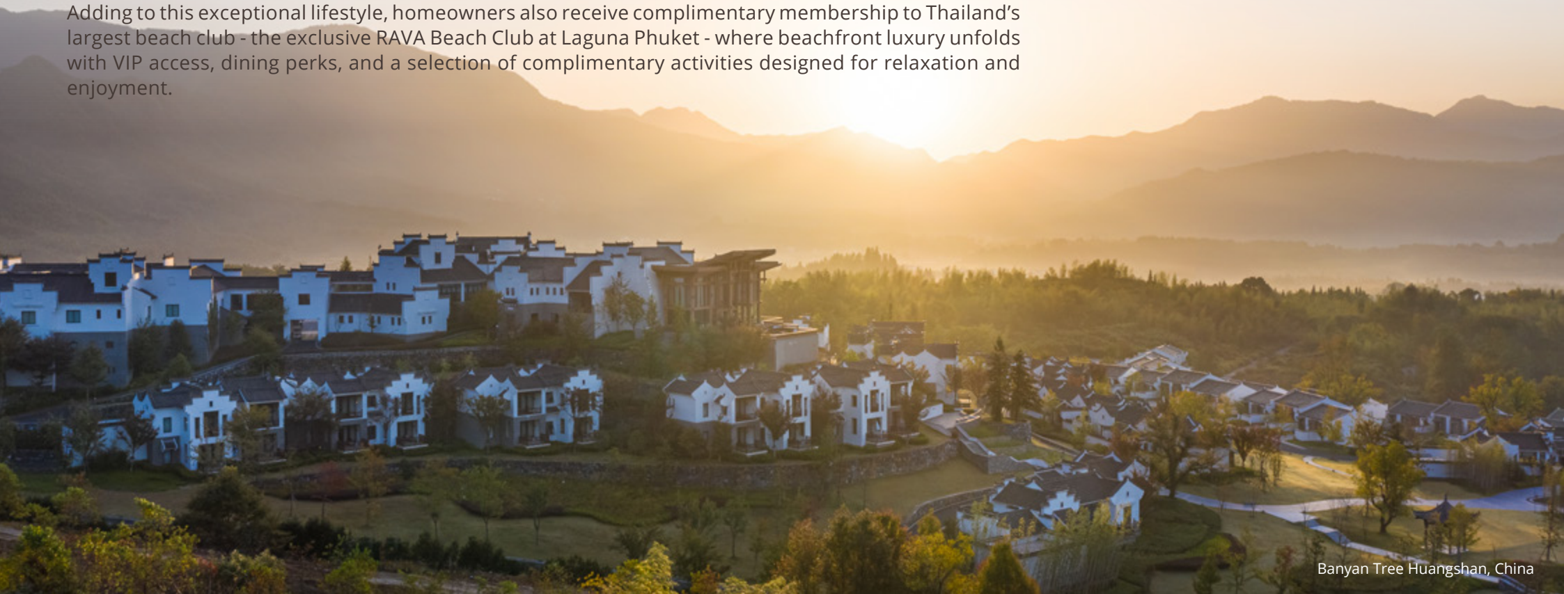
Banyan Tree Huangshan, China

Adding to this exceptional lifestyle, homeowners also receive complimentary membership to Thailand's largest beach club - the exclusive RAVA Beach Club at Laguna Phuket - where beachfront luxury unfolds with VIP access, dining perks, and a selection of complimentary activities designed for relaxation and enjoyment.