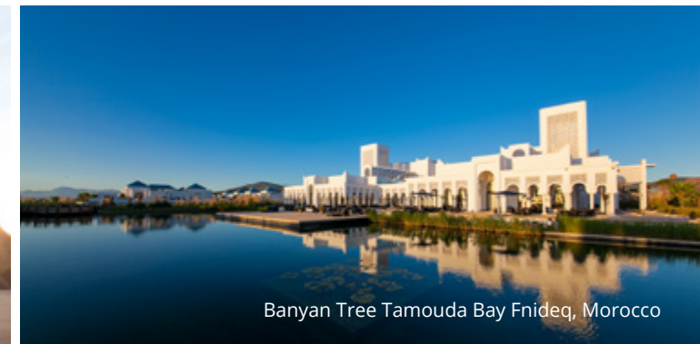
Banyan Tree Tamouda Bay Fnideq, Morocco