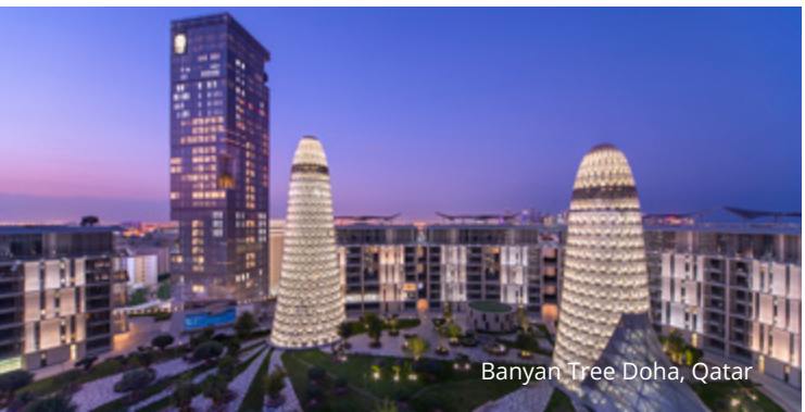
Banyan Tree Doha, Qatar