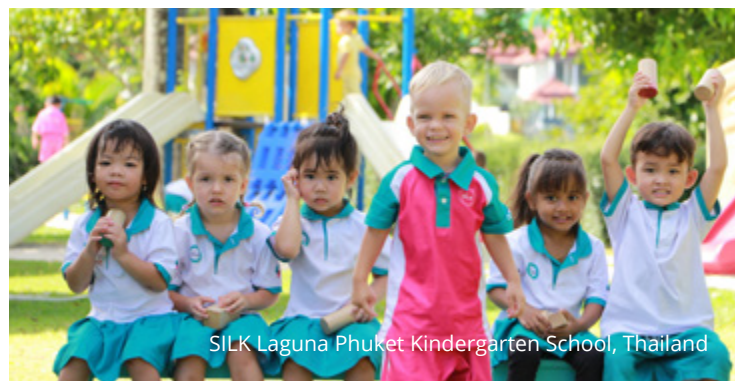
SILK Laguna Phuket Kindergarten School, Thailand