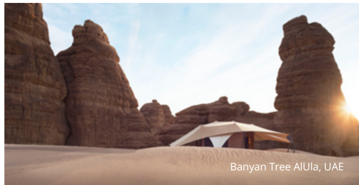
Banyan Tree AlUla, UAE